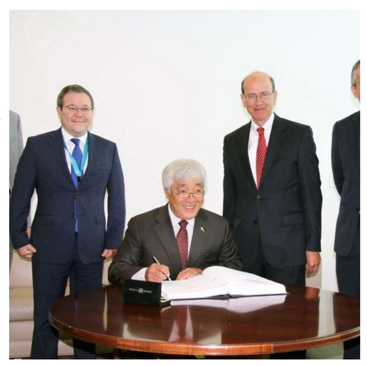
Kazakhstan MFA Idrissov signing the Paris Agreement in UN quarters in New York